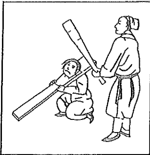
Punishment ordered by followers of Han Fei

Legalism is a philosophy based on the ideas of Han Fei (pronounced HAHN-FAY), a Chinese man who lived during the Zhou (pronounced JOE) dynasty around 280 to 233 B.C.E. Han Fei was born a prince of the royal family of the state of Han. As a young man he received an excellent education under the most important Confucian scholars of his day. Surrounded by Chinese states battling for power under the weak Zhou empire, Han Fei questioned whether following Confucian principles could solve society's problems. He did not agree with Confucian teachings that claimed proper behavior alone could create a stable and peaceful society. In a book called Han Feizi (pronounced HAN-FAY-ZUH), or "Basic Writings," Han Fei instructed rulers to